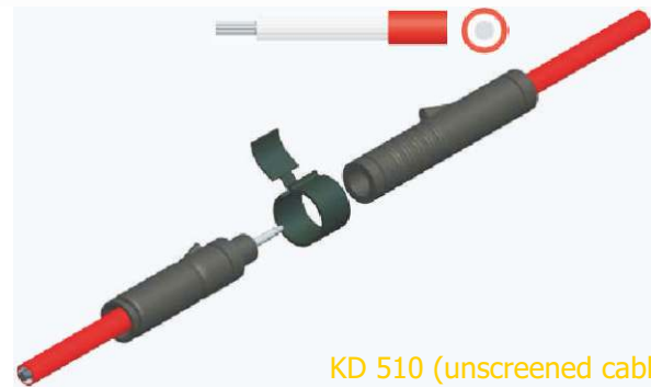
KD 510 (unscreened cable)