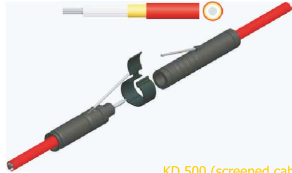
KD 500 (screened cable)